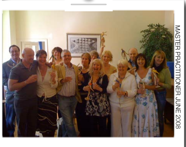
MASTER PRACTITIONER JUNE 2008