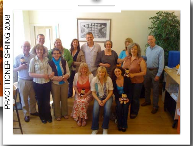
PRACTITIONER SPRING 2008