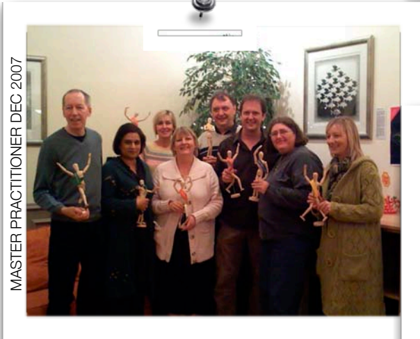
MASTER PRACTITIONER DEC 2007