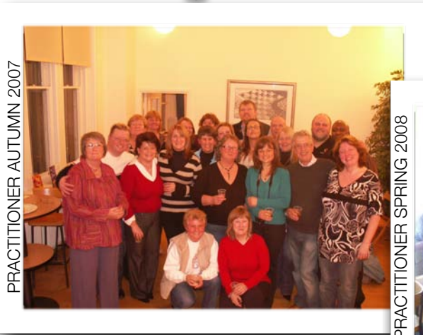
PRACTITIONER AUTUMN 2007