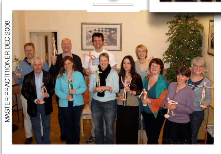
MASTER PRACTITIONER DEC 2008